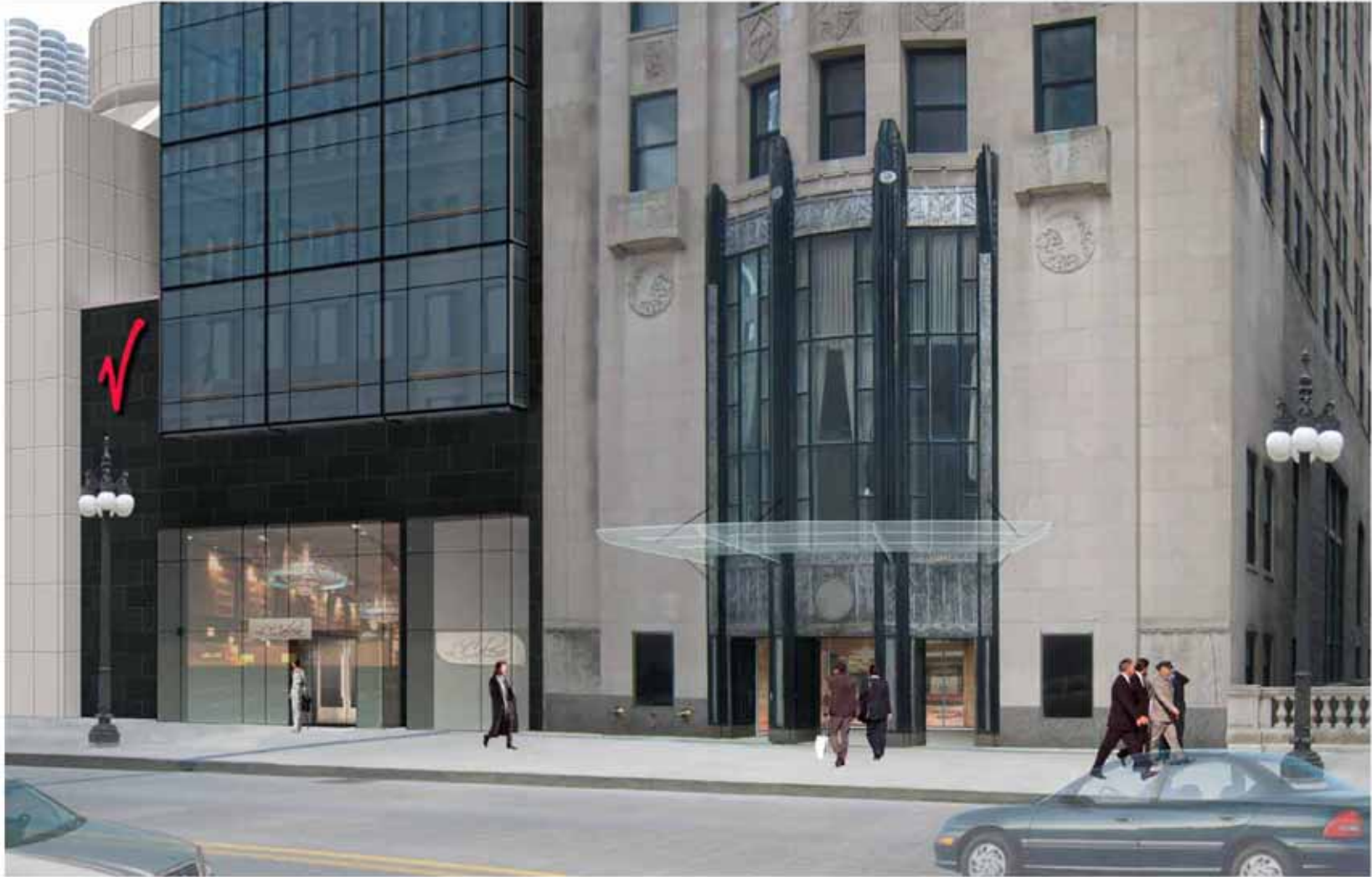
PERSPECTIVE AT STREET LOOKING NORTH WACKER TOWER HOTEL CHICAGO, ILLINOIS