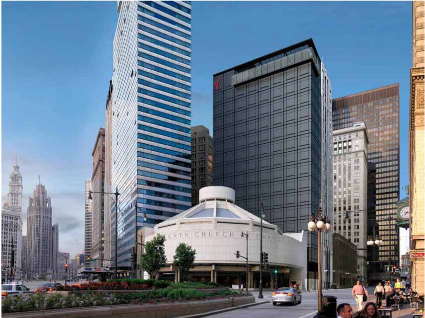
PERSPECTIVE AT STREET LOOKING NORTH-EAST WACKER TOWER HOTEL CHICAGO, ILLINOIS