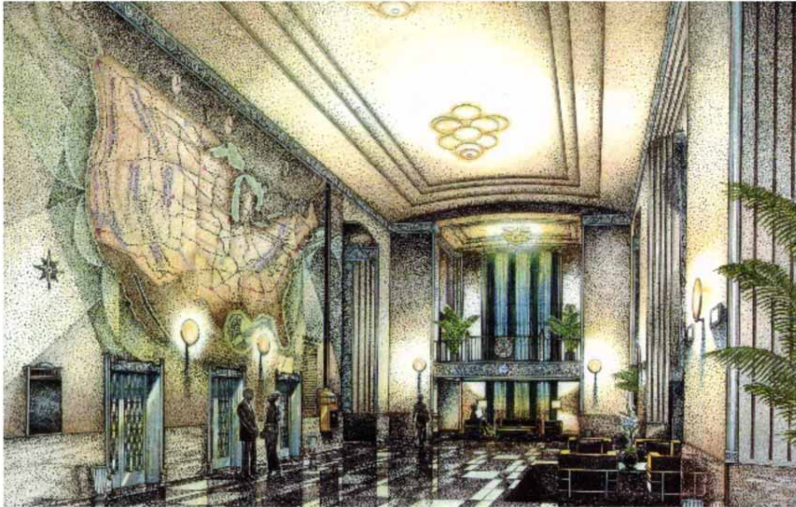
GRAND LOBBY WACKER TOWER HOTEL CHICAGO, ILLINOIS