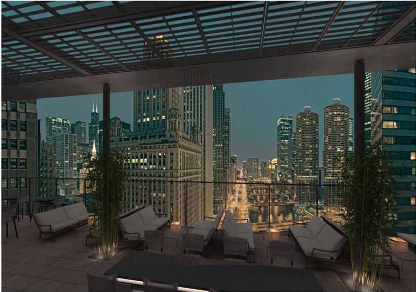
PERSPECTIVE AT TERRACE LOOKING WEST WACKER TOWER HOTEL CHICAGO, ILLINOIS